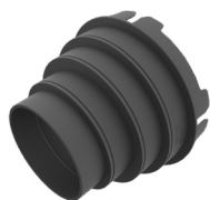
Hooded Slate Adapter RTV-ADHS