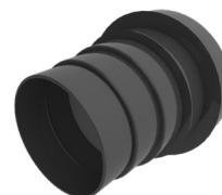
Multi Adapter RTV-ADMULTI