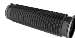
110mm Flexipipe RTV-KIT1