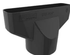
Plain Adapter RTV-ADP