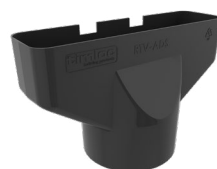
Standard Adapter RTV-ADS