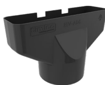
Standard Adapter RTV-ADS