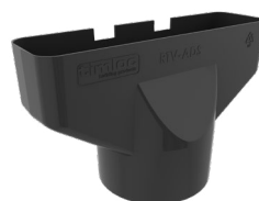
Standard Adapter RTV-ADS