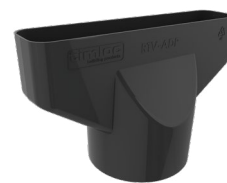
Plain Adapter RTV-ADP