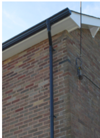
After installation ↑

Heritage Textured Black - BBA approved, factory applied, Polyester Powder Coated (PPC)