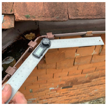
the unsuitable plastic ones.

Side-fix rafter brackets for the front elevation and an unusual angle at the back of the property were required.